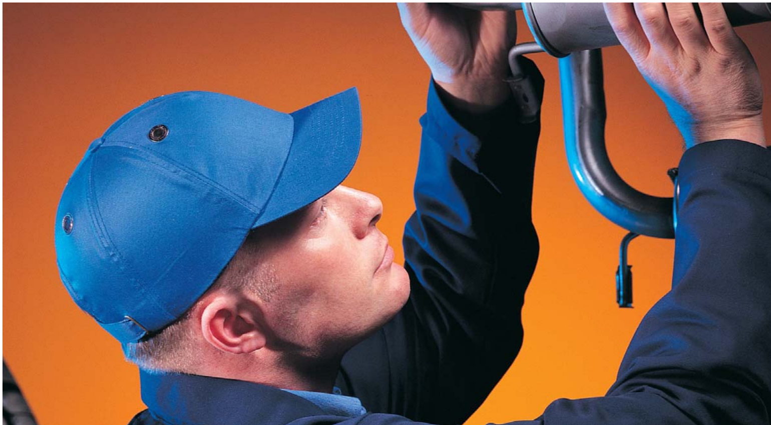
Baseball Bump Cap in Royal Blue